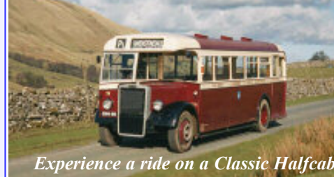
Experience a ride on a Classic Halfcab

Tel: 015396 23254 for outings/private hire